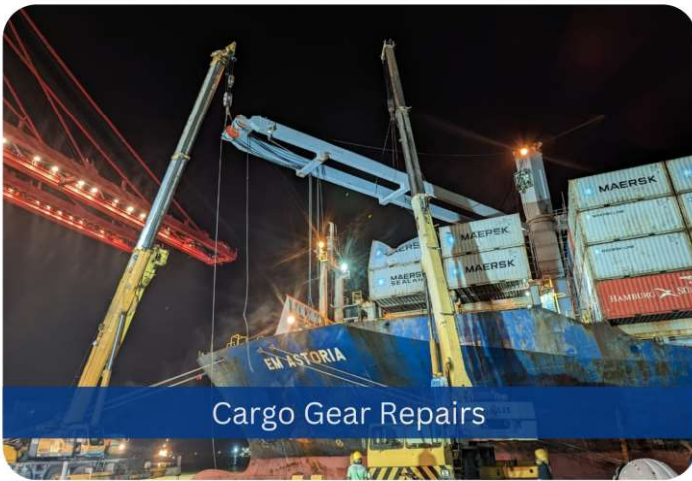
Cargo Gear Repairs