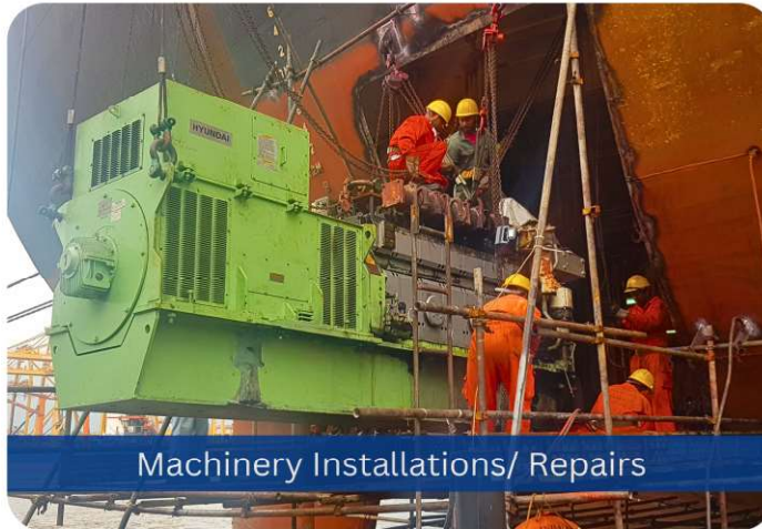
Machinery Installations/ Repairs