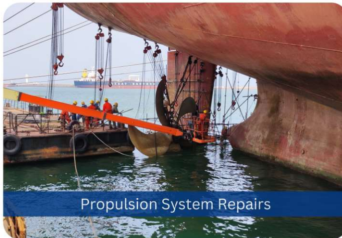
Propulsion System Repairs